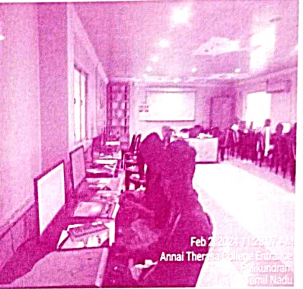
Feb 2, 2024 11:28:17 AM Annai Therasa College Entrance Pulikundram Tamil Nadu