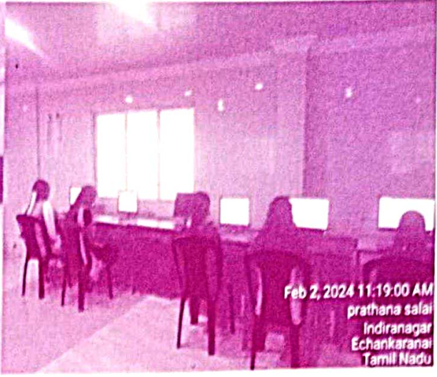
Feb 2, 2024 11:19:00 AM prathana salai Indranagar Echankaranai Tamil Nadu